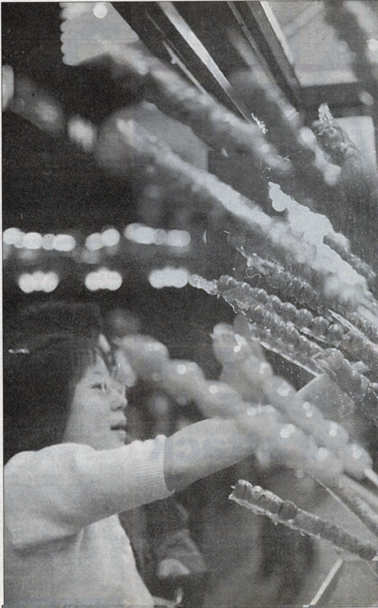
Delicious tanghulu: Tanghulu, sugar-coated hawthorns on a stick, are a popular local treat at the famed Wangfujing Night Market.