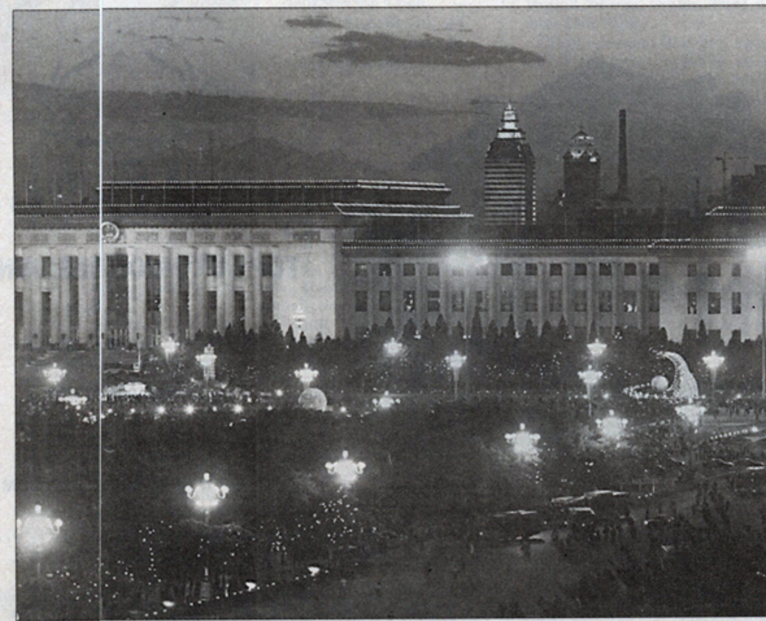
In living colour: Beijing is illuminated and flashy for the holidays.